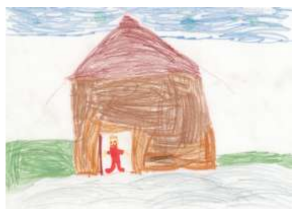
Figure 4: Roman cannot play outside unsupervised and has no friends in the neighborhood.