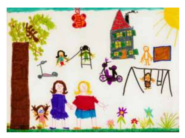
Figure 5: Beatrice can go outside by herself. She depicts an environment rich in details and has around 20 children to play with.